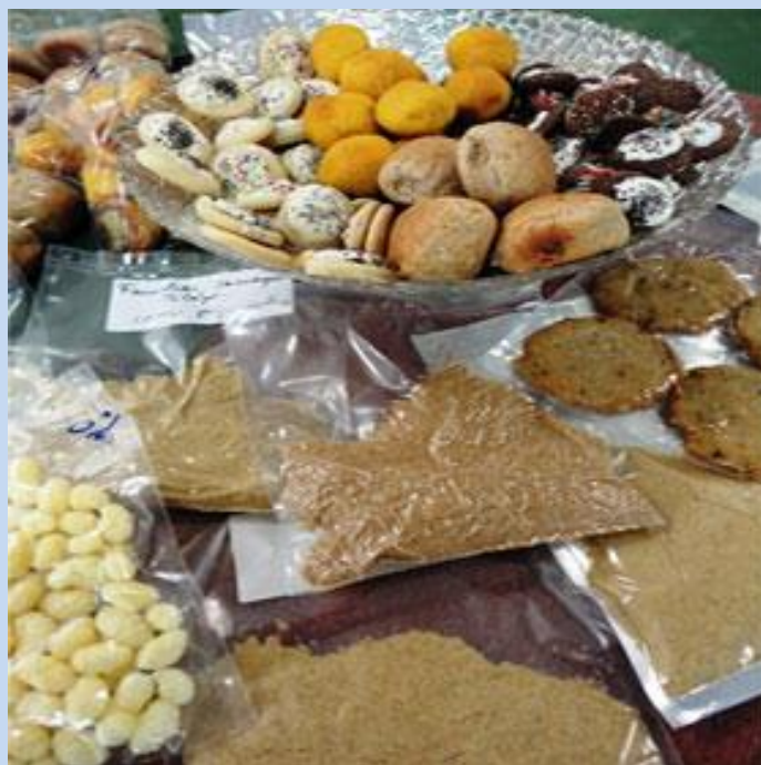
Brésiliens diversifiant leur transformation des produits de tilapia - voir l'article ci-dessous *

Si vous souhaitez envoyer et de partager toute information, publications, etc pour être inclus sur les sites web et cette mise à jour s'il vous plaît envoyez à douglas.waley@stir.ac.uk