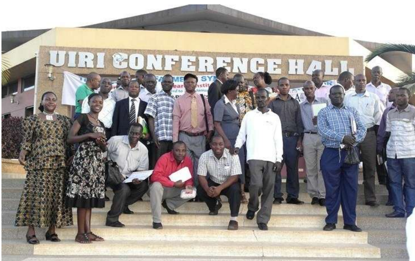
This year strong representation from commercial , research and govt sectors