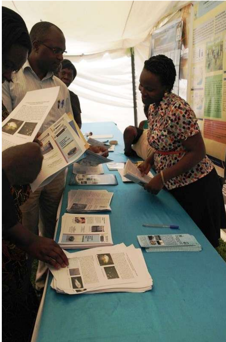
Participants receiving literature from the NAFIRRI stand