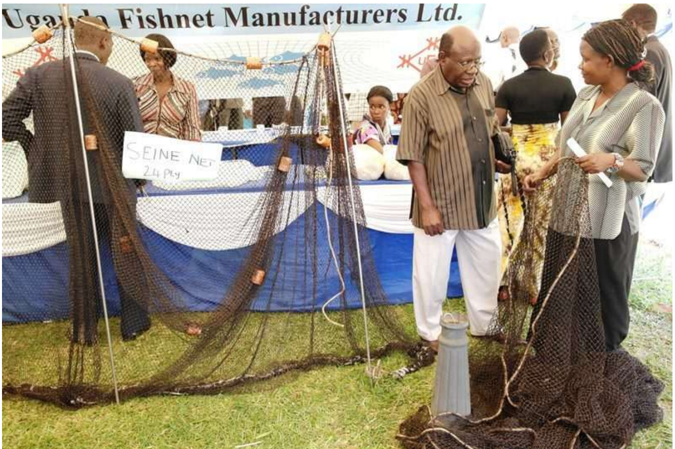
Ugandan Companies developing their range of aquaculture equipment to support an industry