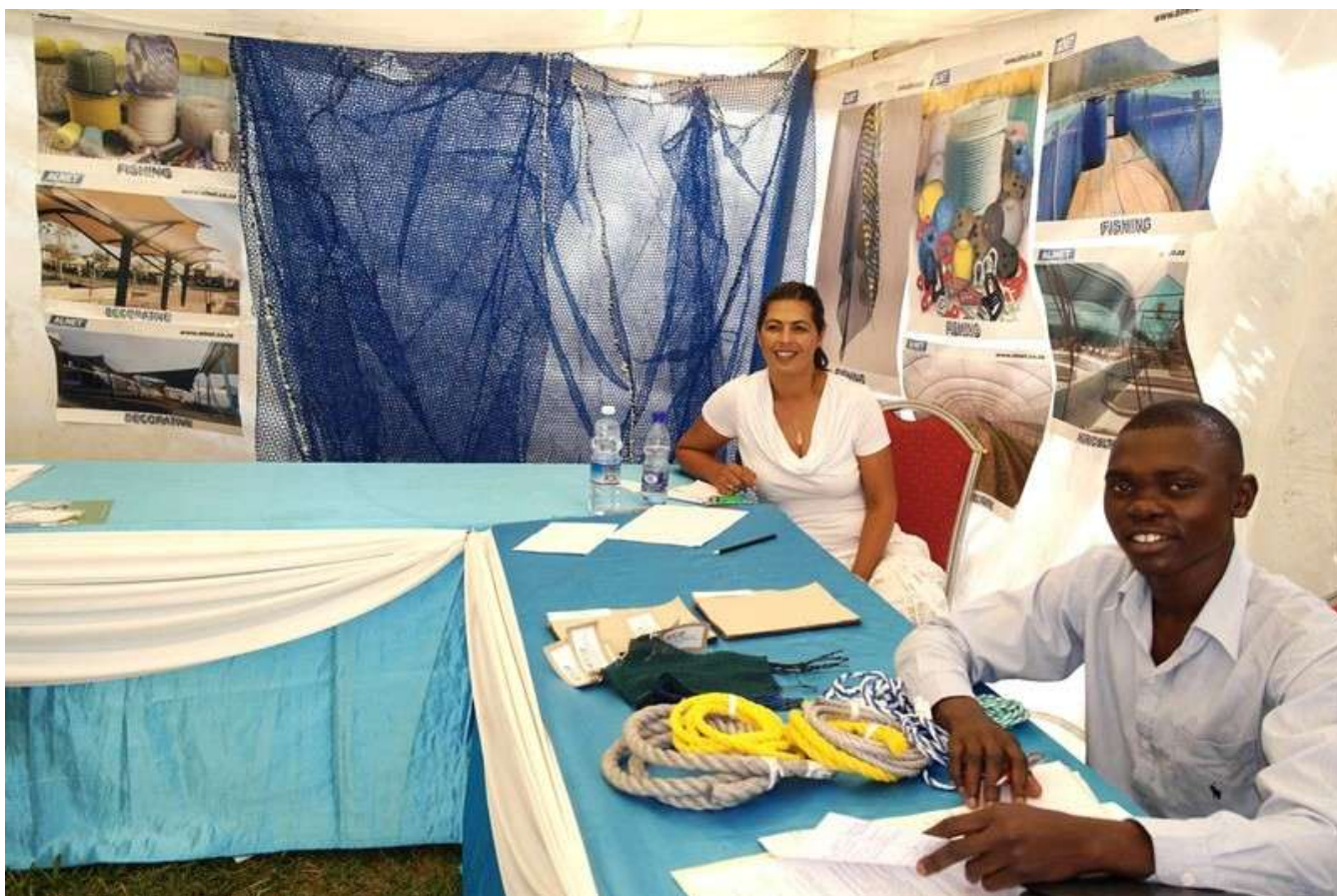
Alnet South African Company exhibit their products at the Trade Fair