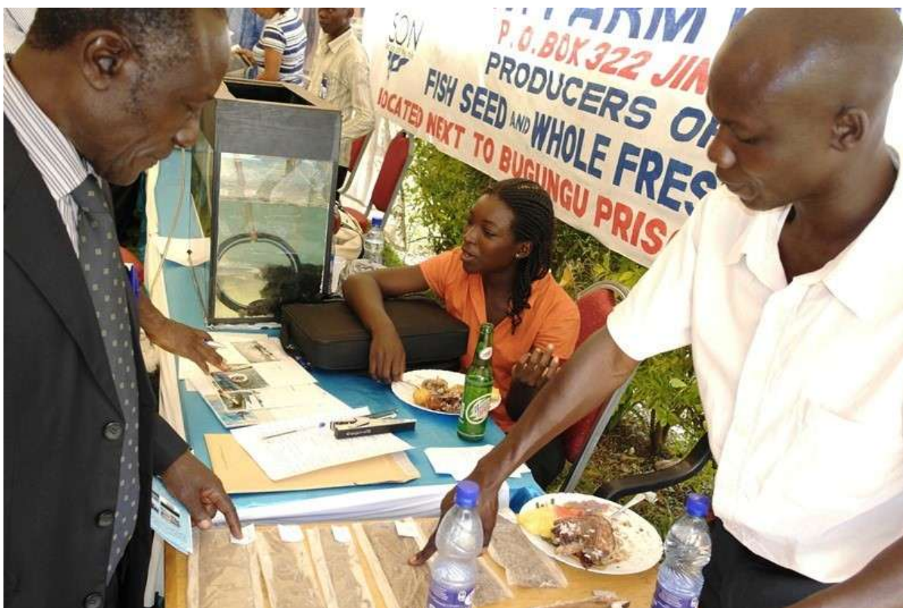
Source of the Nile SON Fish Farm Stand - Uganda's largest Commercial Tilapia producer