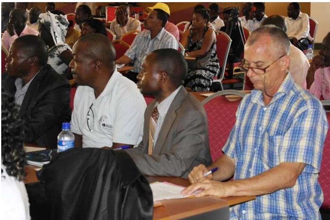
Participants enjoy comprehensive programme of presentations